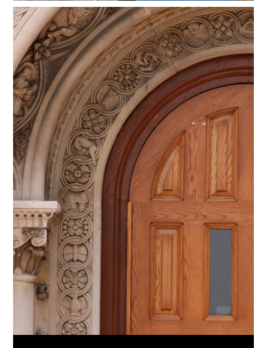
Office of Development 8800 West Bluemound Road Milwaukee, Wisconsin 53226

414.443.8823 Fax 414.443.8510 donor.services@wlc.edu wlc.edu/giving